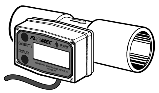
TM Meter with Computer Display & Pulse Output